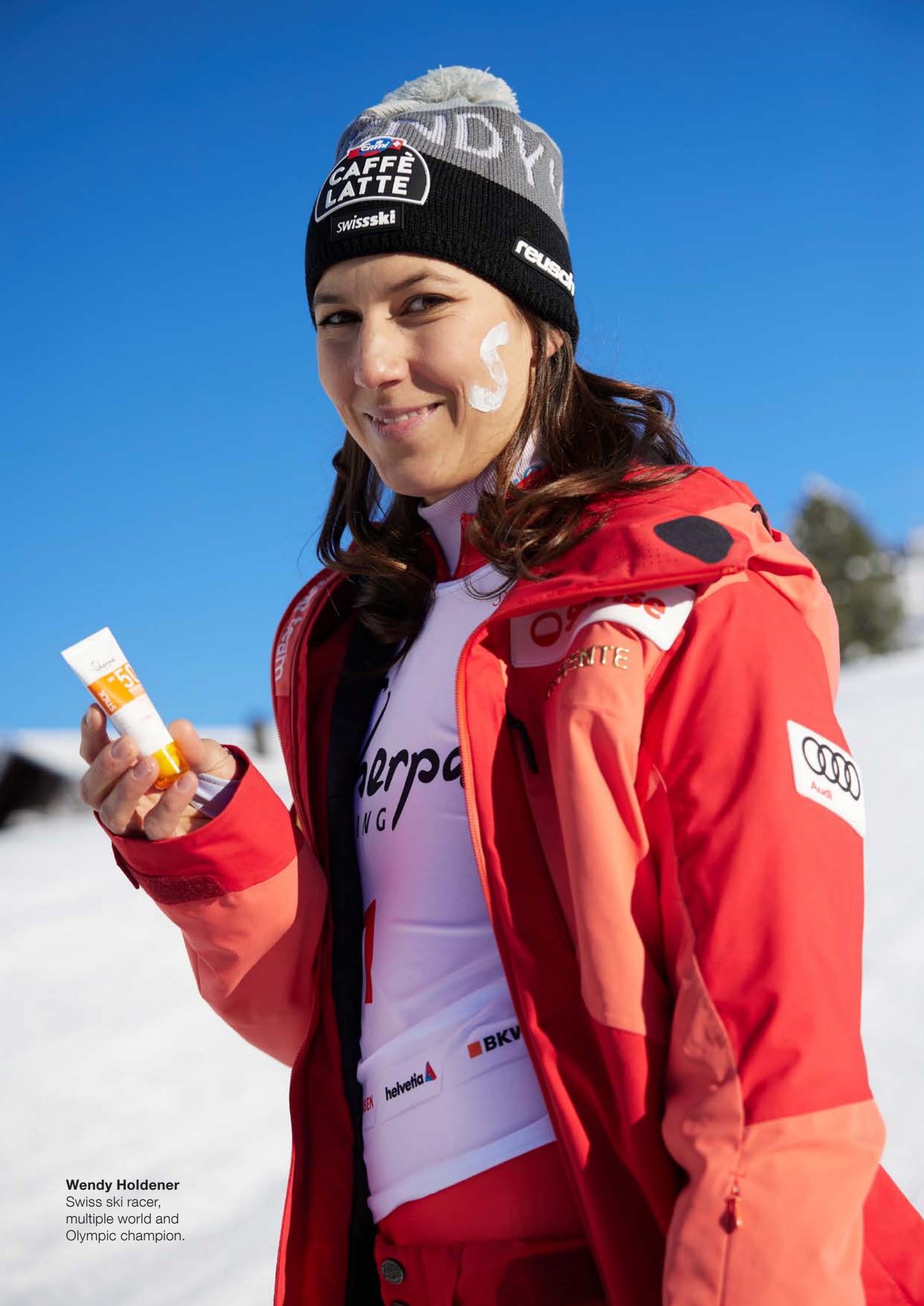
Wendy Holdener Swiss ski racer, multiple world and Olympic champion.